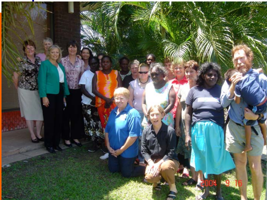
CLO FORUM 2004